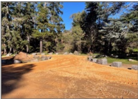
The campground has been reconfigured to protect the trees by directing traffic, and by clear designation of camping spaces.

working on reopening the park ever since and is pleased to announce they expect both the trails and a newly refurbished Oak Forest campground (completed by Djandak, the commercial arm of Dja Dja Wurrung corporation) to be reopened in October.