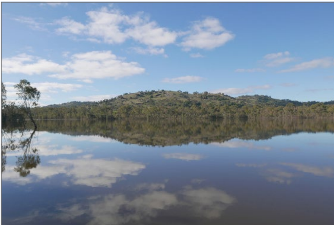
Barkers Creek Reservoir on a recent winter's walk.

A PERFECT WINTER'S AFTERNOON: 3pm on 25 July. Clean, crisp air, no wind. I go to Barkers Creek Reservoir whenever I need to be near water – the vast expanse of water and sky lifts my spirits and refreshes my outlook on life. Walking is great for writing and opening up deeper thoughts. And for letting go. Things become clearer.