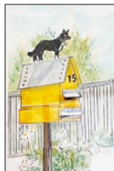
Many readers will recognise this letter box in High Street.