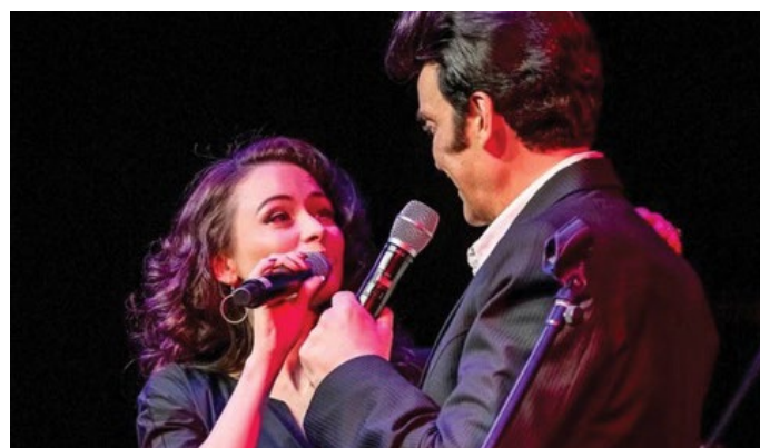
Johnny Cash and June Carter Tribute Show

Victorian Seniors Festival Country Concert