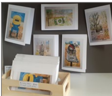
Leigh's art cards at the post office.