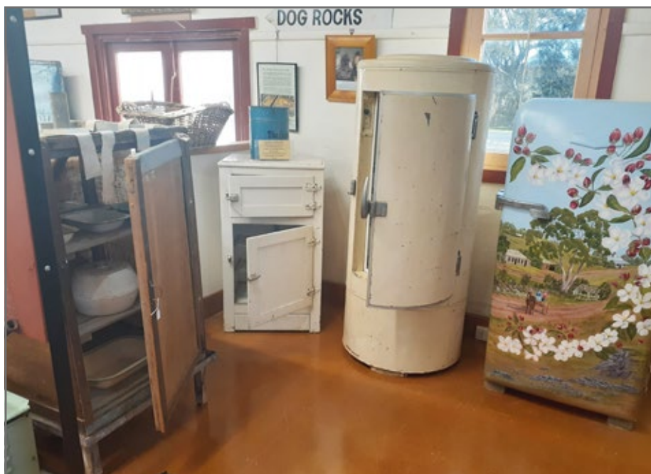
From left to right: Coolgardie safe, 'The Frigid' ice-cream maker on top of an ice chest, the circular Rotafrig, and the Pope refrigerator painted with a scene of Harcourt.

It is not the intention of Harcourt Heritage Committee to present a comprehensive history of refrigeration. It is true that export shipments of Harcourt apples were made in the holds of refrigerated cargo ships to northern hemisphere ports from the 1880s. Fruit storage at Harcourt Coolstores was made possible by refrigeration powered by a steam driven compressor from 1919 onwards, and upgraded to electricity in the mid-1930s. Today