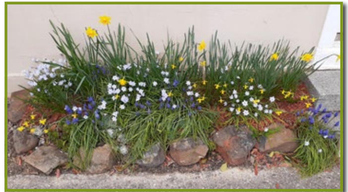
The spring garden at the Post Office is once again in full bloom. It is flourishing. Thanks go to Liz Ward who created the garden a few years ago.