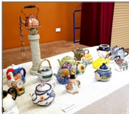
A small sample of the 100 teapots on display.