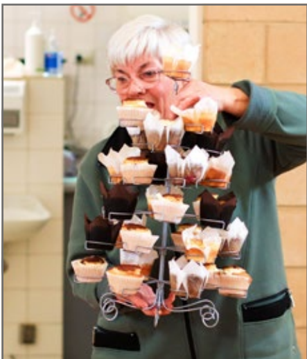
Reinforcements of Marlene's Marvellous Cupcakes heading for the refreshments table.