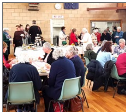
The guests enjoying our afternoon tea.