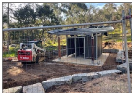
The new amenities block under construction.

Having a professional trail building company coming in to fix this type of extensive damage also presented the opportunity to update features