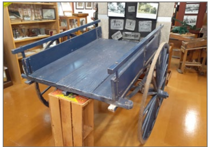
The cart in place in the museum. The cart has very long staves which the horse stood between to pull the cart. The museum is deciding how these will be displayed.

To the other Lions, The Harcourt Lions Football Netball Club, we wish you a roaring success in the Finals. Go Harcourt!