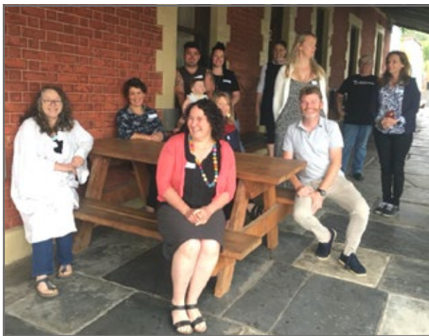
Participants from the first small business program in December 2020.