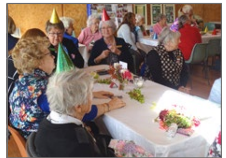
Guests enjoying the proceedings.