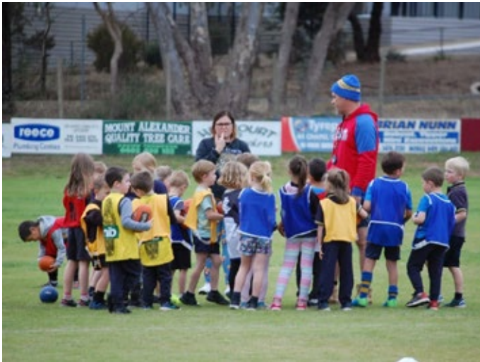
Auskick is very popular, with more than 35 children taking part this year.