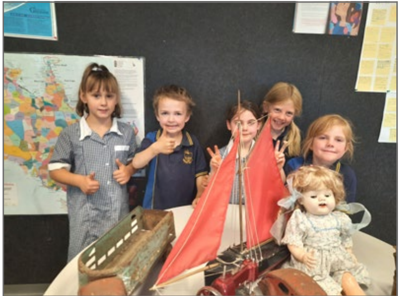
Grade 1/2 students were fascinated with the items brought in by the adults on Grandparents/Special Friends Day.

I took along an old doll and was surprised and delighted that almost as many boys as girls came over to ask me questions about the doll. My favourite toy on the day was a toy sailing boat made by one of the student's great-grandfathers. What a treasure!